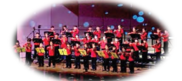
YCIS Junior Violin Ensemble